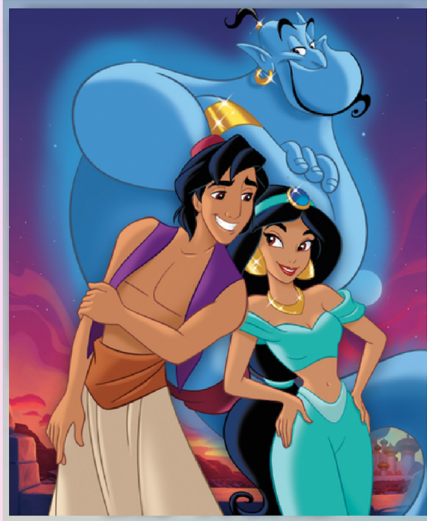
Aladdin and the Magic Lamp