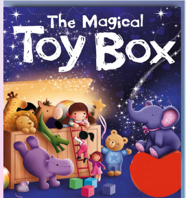
The Magical Toy Box