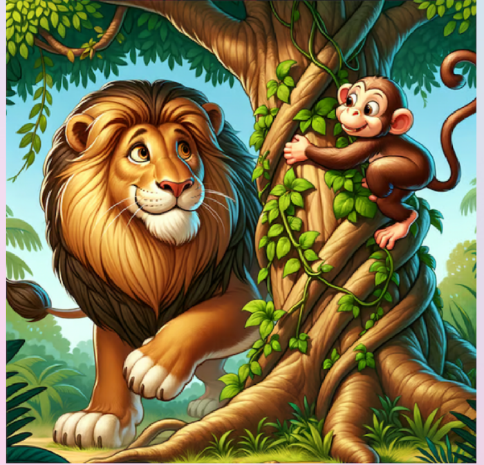
The Lion and the Monkey Play Hide and Seek