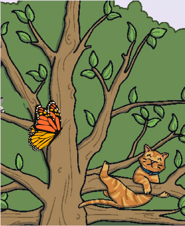
The Cat Who Got Stuck